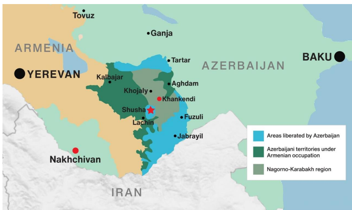
Fig. 5 – Situation in the front on November 8 (Azerbaijan liberates Shusha)

The political and military leadership of Azerbaijan, which predicted the attack of the Armenian Army, in fact carried out a deceptive activity similar to the "Operation Bodyguard". Thus, after the events of Tovuz in July 2020, the Armenian leadership formed the opinion that if the Armenian Army attacks, the Azerbaijani Armed Forces will counterattack in the direction of Aghdam. Thus, while the Armenians expected Azerbaijan to counterattack from the east of Nagorno-Karabakh, the Azerbaijan Army broke through the enemy's defense in the southeast and advanced to a depth of tens of kilometers in a short time (Figure 5).