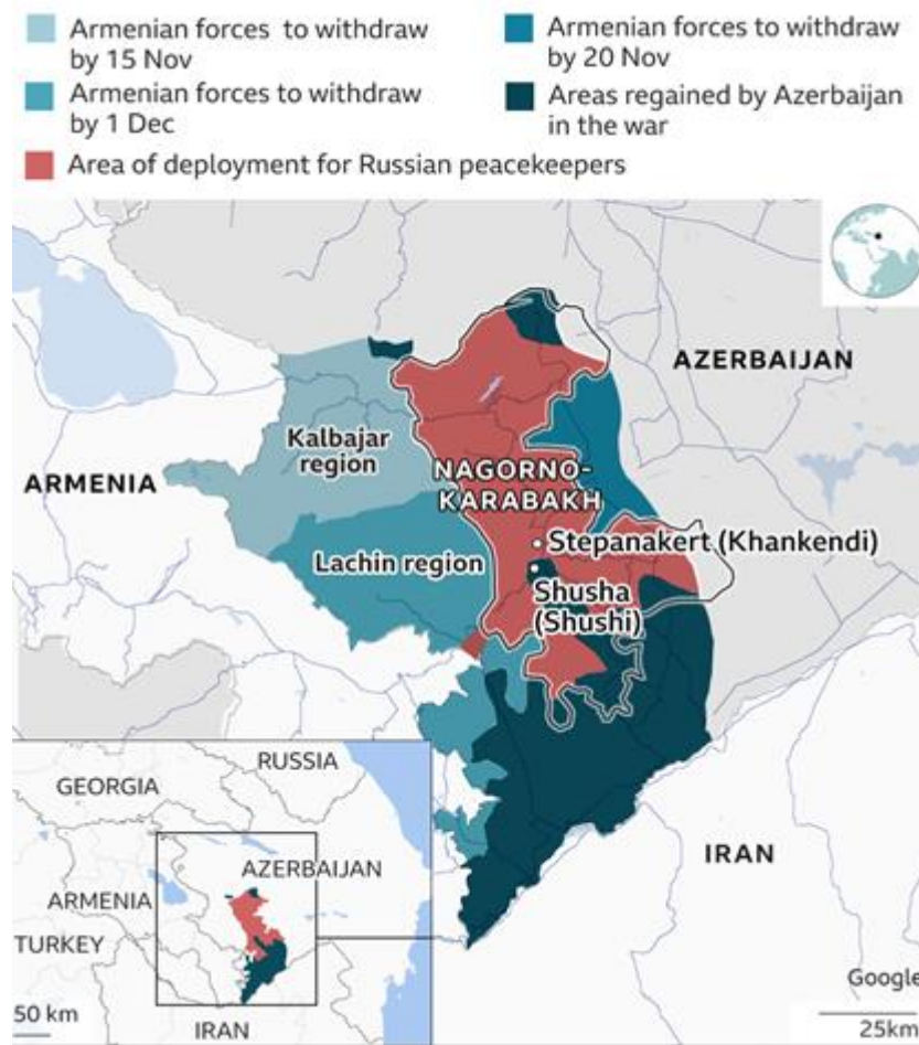
Fig. 6 – Situation in the front on November 10, 2020 (Armenia-Azerbaijan)

statement of November 10, 2020 (Figure 6).