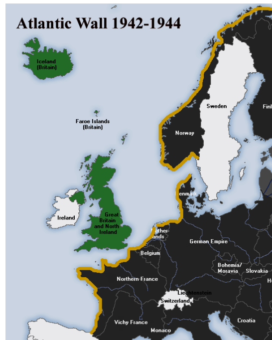
Fig. 3 – Atlantic wall (Operation Overlord & Neptune)

reassured Hitler in 1944. Thus, the Nazi army had prepared strong fortifications from the west coast of France to the coast of Norway against any possible attack by allied forces. This “Atlantic wall” was designed to protect the new German Empire from the Atlantic Ocean (Figure 3).