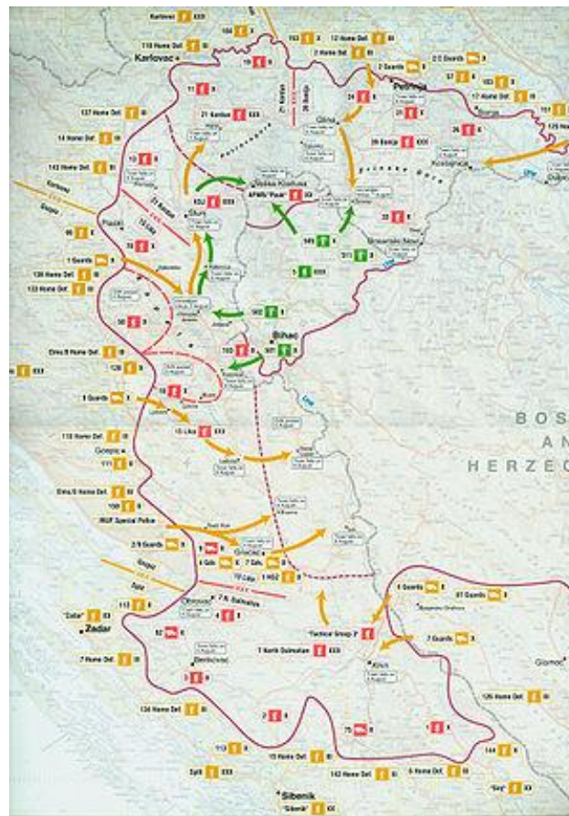
Fig. 1 – Operation Storm (Operation Storm)

as “Operation Storm” initiated by Croatian Army in August 1995 (Figure 1).