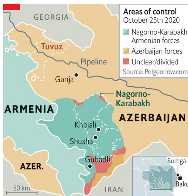
Fig. 2 – Situation in the front on October 25 (The fighting in Nagorno-Karabakh)

considered negligible. Armenia has no choice but to make concessions" (Zachary Kallenborn). Apparently, Kallenborn did not rule out that Armenia had lost more by emphasizing the "open source information". As a result of a successful operation conducted by the Azerbaijan Army in the direction of Gubadli, the units of the Armenian Armed Forces were forced to withdraw from important heights and a number of positions (Figure 2). Serious blows were inflicted on the 155th artillery regiment, the 5th mountain regiment and the 543rd regiment located in the direction of Aghdara. Newly arrived volunteers at the enemy's artillery units north of Hadrut left the firing positions and began to flee. In the Khojavend, Fizuli and Gubadli directions of the front, the enemy's weapons, ammunition and fuel depots were destroyed and important communication lines were taken under control. Most of the conscripts sent to Nagorno-Karabakh from the Tsakhkadzor settlement of the Kotayk province of Armenia perished. Numerous enemy vehicles were destroyed in different directions of the front (Heydər Piriyeu).